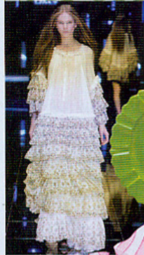
Dress, Dolce & Gabbana.