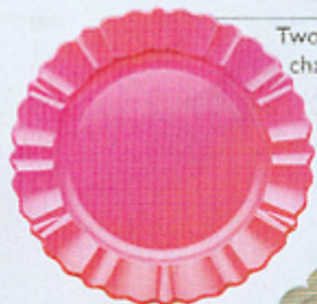
Two's Company charger plates, Scantrade.