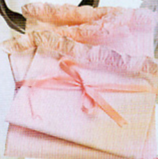
Laundry bag, Stella Bleu Home.