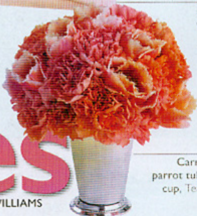
Carnations and parrot tulips in julep cup, Teatro Verde.