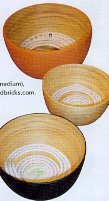
Bamboo bowls, $39.50 (large), $14.95 (medium), by Bambu. 877-435-5176; strawsticksandbricks.com .