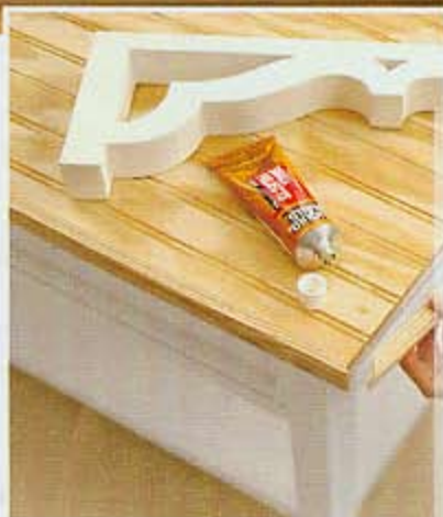
Table: 683W Seneca coffee table, about $198, whittierwood.com

Sweet Spot Ready-made gingerbread from a home improvement store gives this table its cottage flavor. Have the store cut beaded board and miter cap molding to fit the tabletop. Attach them and decorative brackets to the table, right , using wood adhesive, clamping until set. Remove original drawer pulls and putty the holes. Then sand, prime, and paint all surfaces antique white. Finish with a coat of polyurethane. Drill holes for and install colored milk glass knobs.