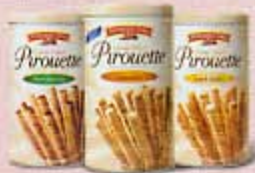
Illustration: © Amy Johnson King 2009

For more dessert tips visit us at www.artofthecookie.com